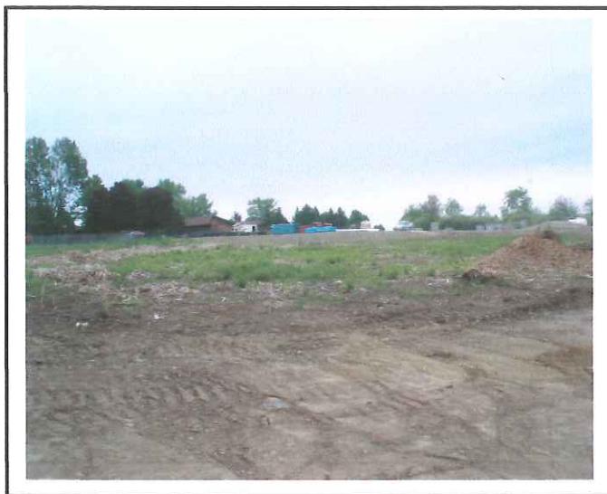
Area that has not been disturbed yet.