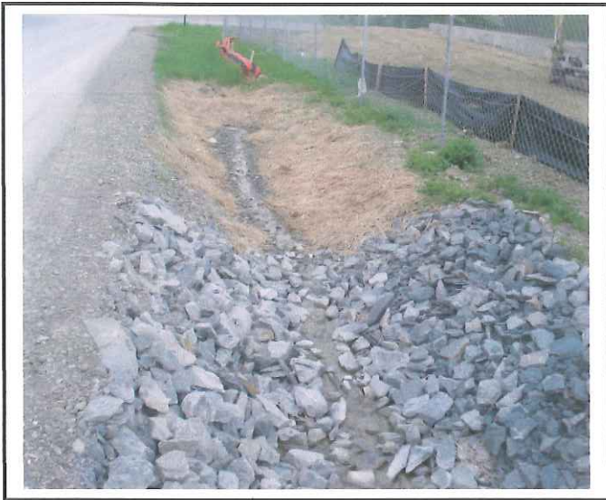
Drainage along Biltmore Drive. Running clear.