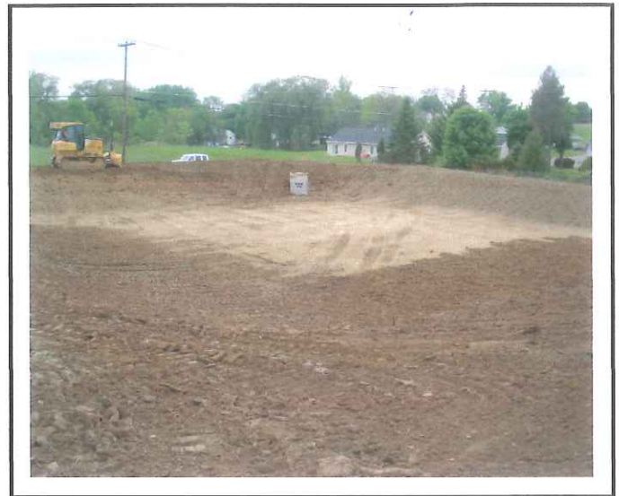
Stormwater pond is almost complete.