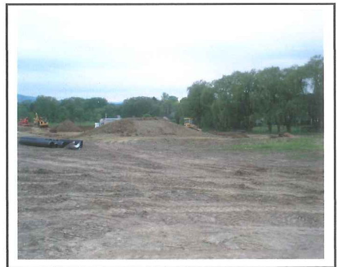
Topsoil pile where material from pond and building pads is being stored.