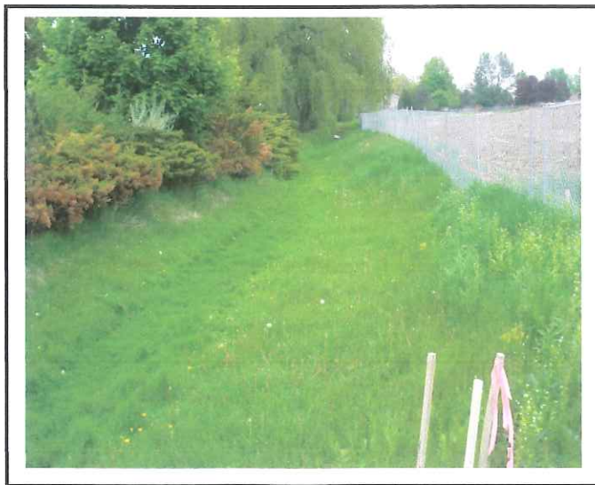
Existing drainage between project site and neighborhood to the North-West.