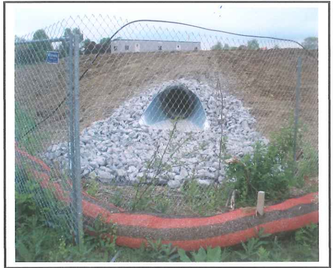
Outlet of Stormwater Pond.