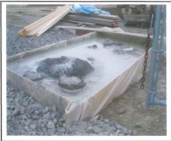
Concrete washout area- This is almost at capacity. Will require maintenance soon.