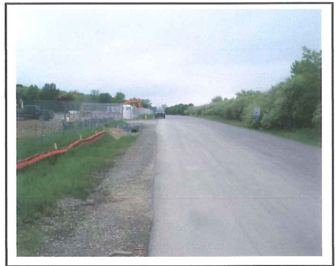
Biltmore Drive-No sediment is being tracked off site.