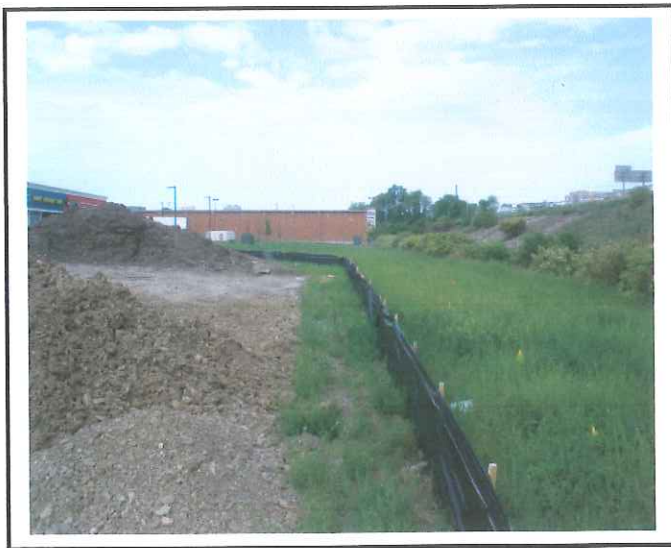
Silt fence with grass buffer.