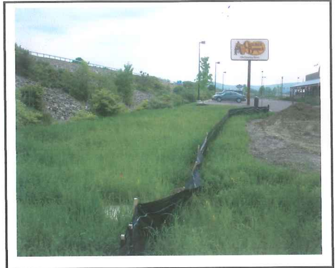
Silt fence with grass buffer.