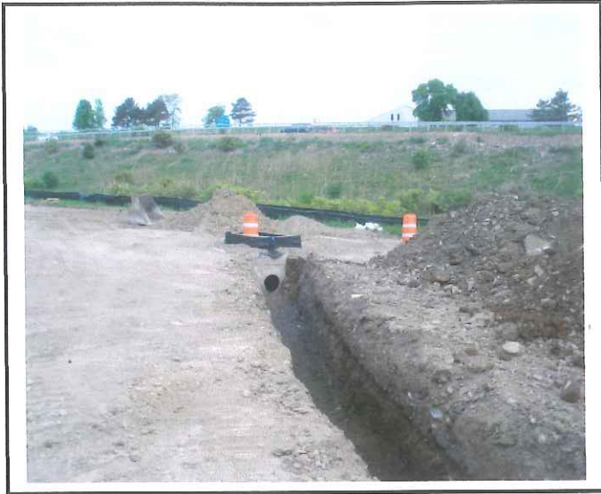
Installing storm sewer.