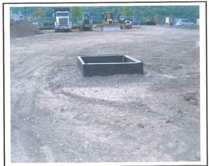
Catch basin protection has been installed.