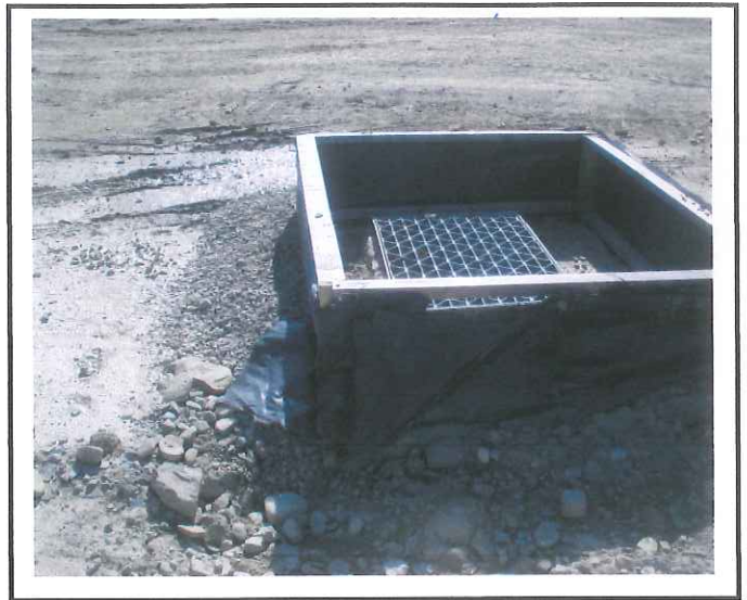
Drop inlet protection has holes and needs to be replaced.