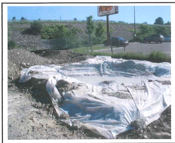
Concrete washout is near capacity and needs maintenance soon.