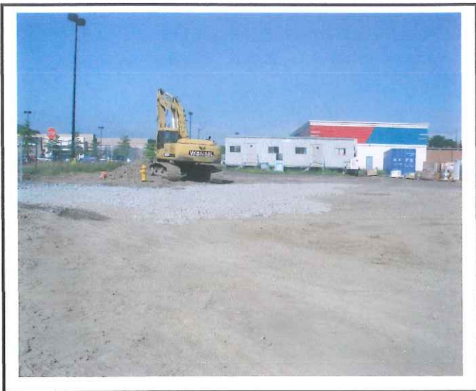
Construction entrance was recently re-topped with fresh stone.