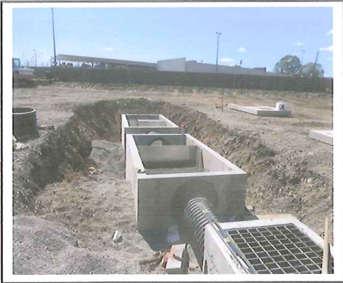
Water Quality Unit's 1 and 2