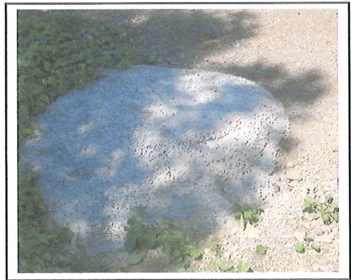
Concrete from the pumper truck was washed onto the ground. All delivery trucks did utilize the concrete washout area.