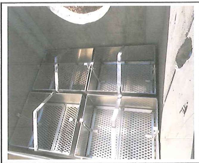
Water Quality Unit 2- The baskets do not have the filter media installed yet.