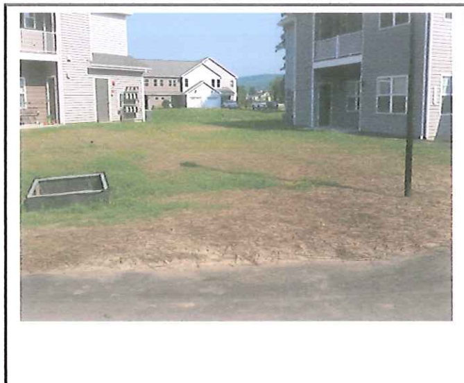
Areas around new buildings have been stabilized and grass is now growing.