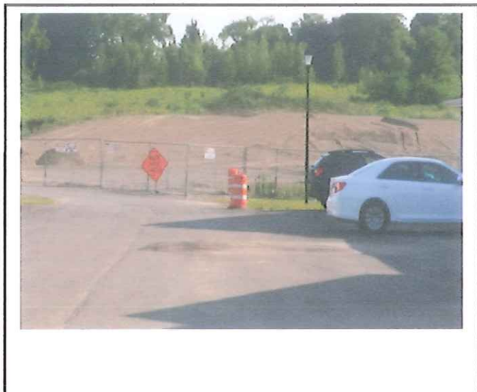
Contractor yard is being topsoiled for restoration.