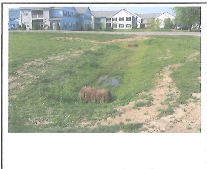
Vegetated swales- some are now holding water again and have trouble establishing vegetation.