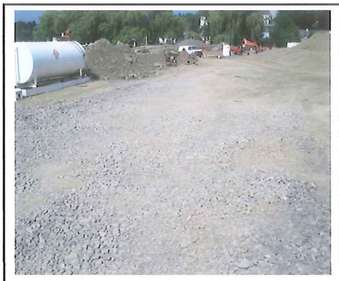
Upper construction entrance is in good shape but there is some tracking onto the road.