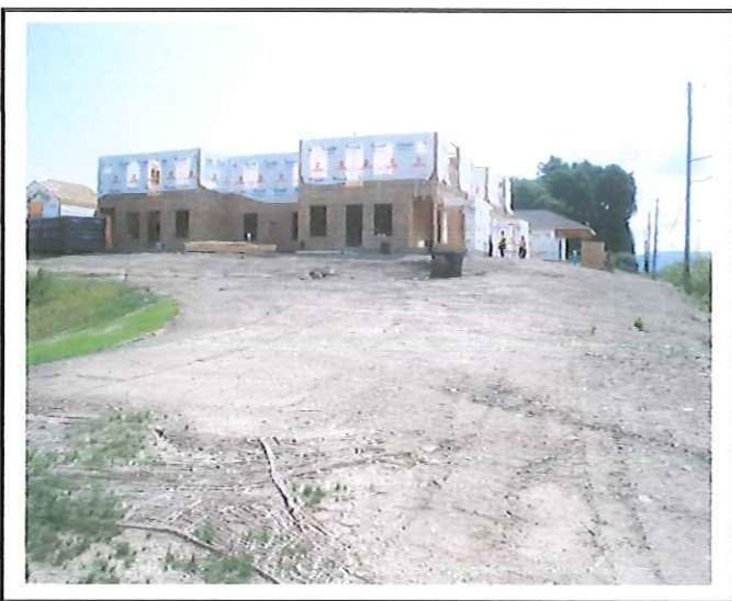
Areas requiring stabilization.