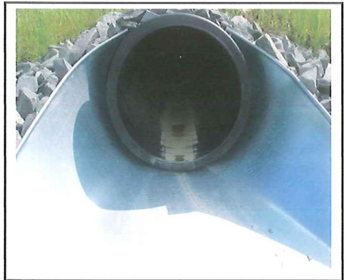
Outlet pipe to pond shows that it has released some water and that it was carrying sediment.