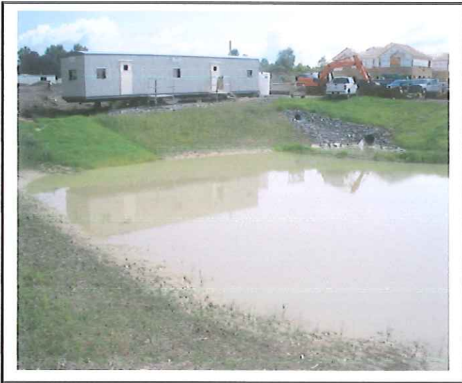
Pond vegetation is mostly weeds. The best grass is growing next to the trailer.