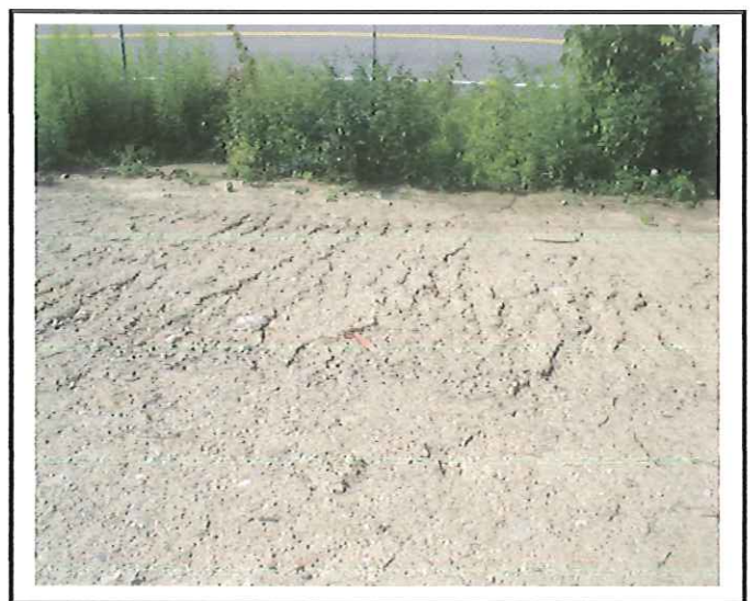
Erosion occurring along Gardner Road. Areas require immediate stabilization.