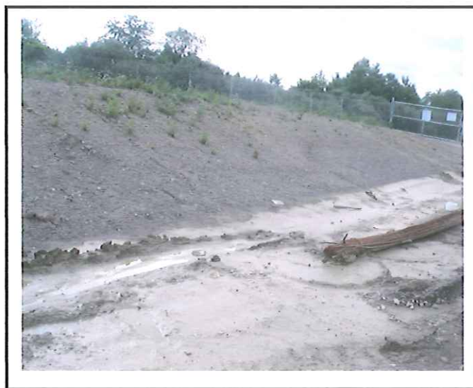
Back slopes require stabilization.