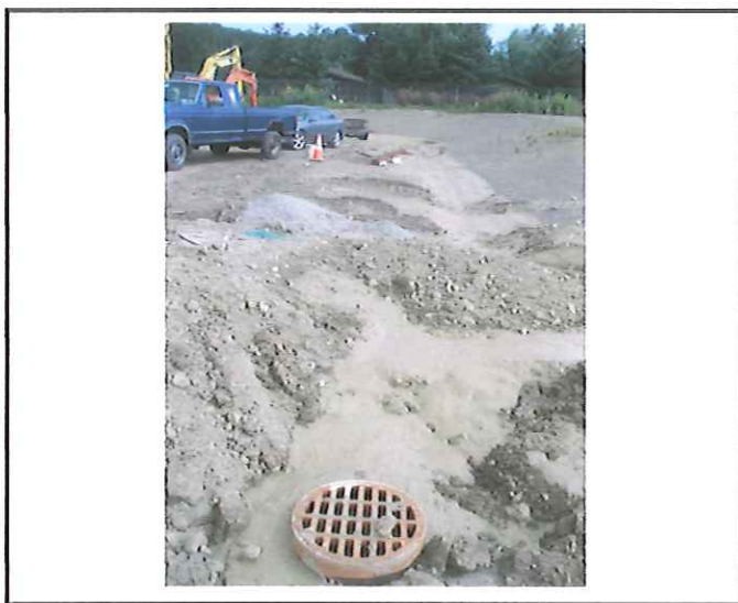
Catch basin is not protected and sediment has gotten into the system.