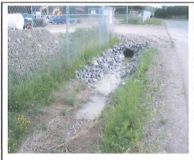
Sediment water is in the Biltmore Drive roadside ditch.