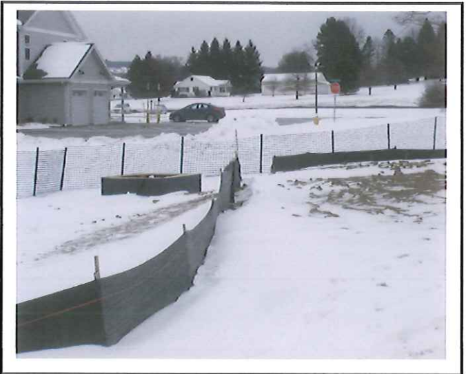
Silt fence requires maintenance.